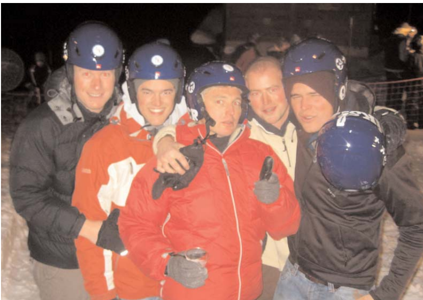
Team Ski Higher - 2nd place losers