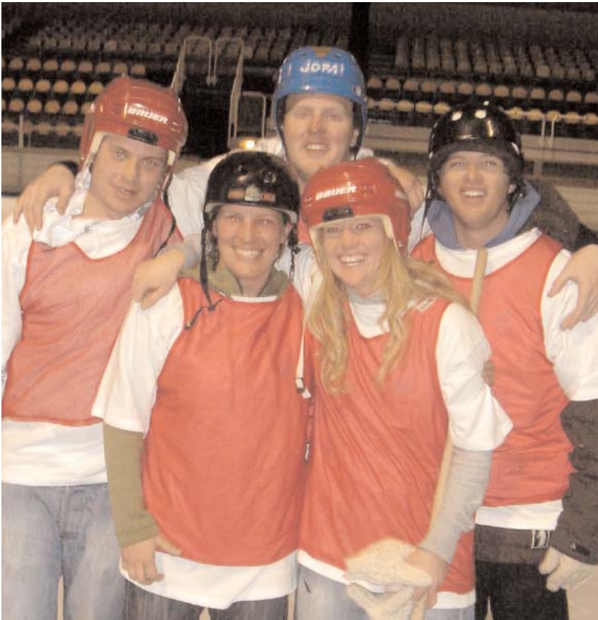
Team freeride show the other english teams how it's done