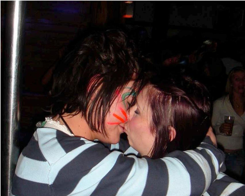
Tor(Skiworld) brought the Kalico dancefloor to a halt