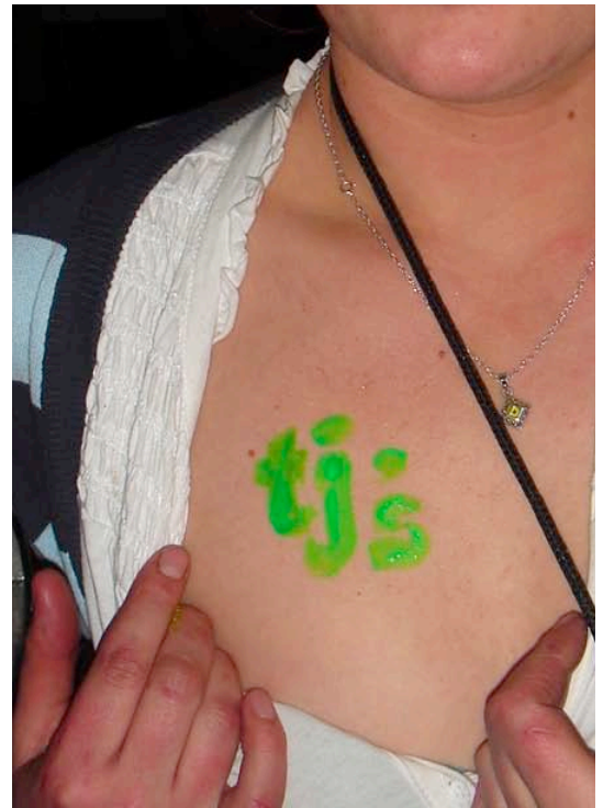
James(TJ's) goes to any length to advertise his bar

CALL FOR CONSULTATION OR MASSAGE 06 68 57 00 99