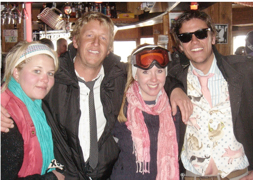
Team Raaar (Skival) best costume