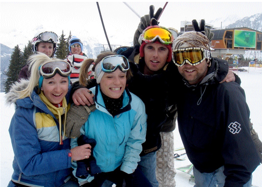
Lyrical bulk by Nick (Supertravel)

Anyone wanting to check out photo from the day. Currently 172 (and counting) from the event can be found on www.courchevelenquirer.com .