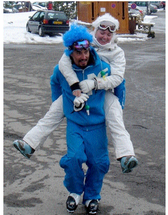
Louis gives one of his team a lift

CALL FOR CONSULTATION OR MASSAGE 06 68 57 00 99