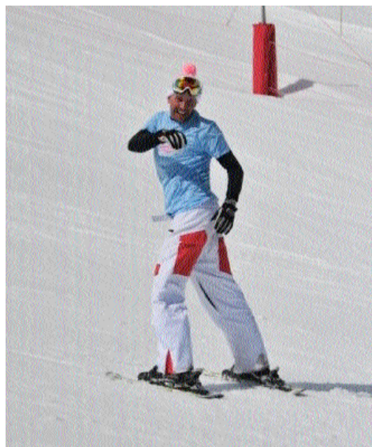
Will going switch on blades

Friday evening and fire was seen coming from another building in 1850. Apparently the chimney stack of the carlina hotel had caught on fire. Luckily this time within 5 minutes of the alarm being raised it had been completely extinguished.