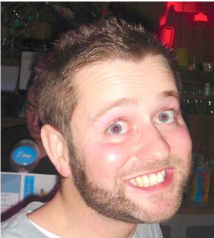
Jack Osbourne Adrenaline junkie