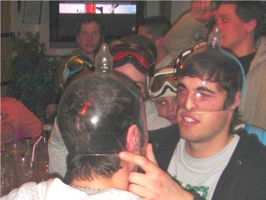
Some seasonnaires still having problems getting to grips with how to properly use a condom