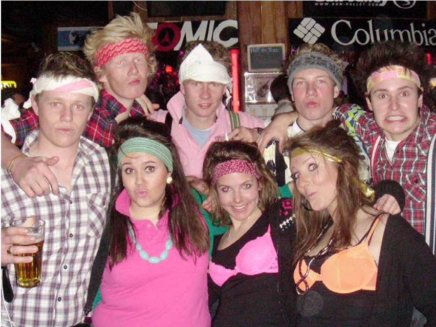
Crystal Finest go all 80s in Kalico

bar. I know some of you value it on the same level as the paper used to wipe your arse. For those I apologise for not printing in Andrex copier paper.