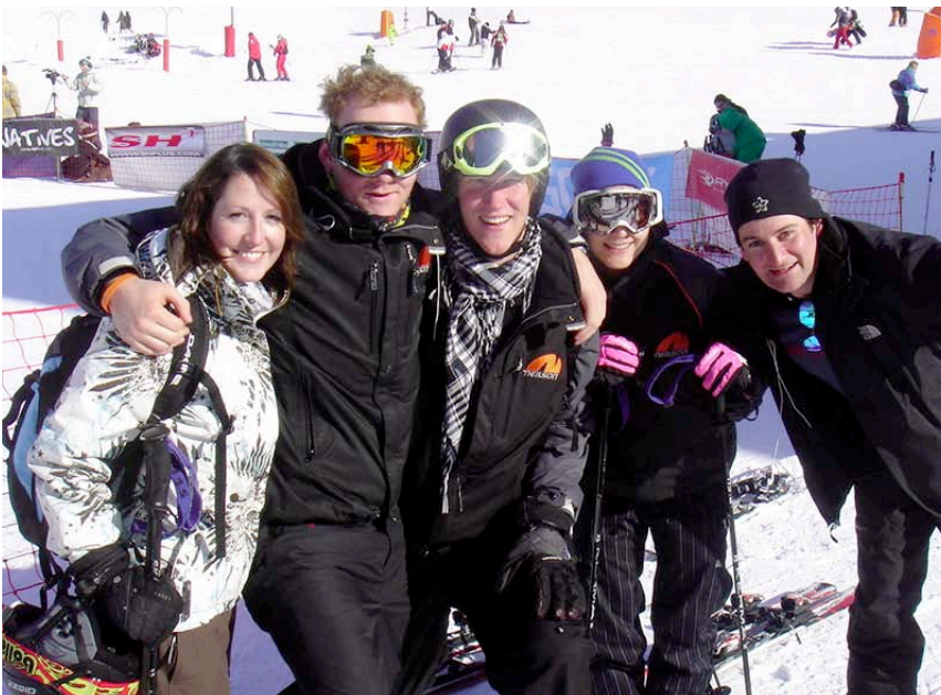
3 Valleys worth of Neilsen staff get ready for the team dual slalom