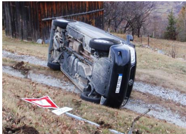
Did you hear that last click as you applied the hand brake?

For a certain company (who for matters of diplomacy will remain nameless) who uses black caravelles to ferry clients around resort, the season didn't start too well. Apparently after only one day on the job it ended up in the above state. Seems after parking the car someone didn't fully engage the hand brake and after 45 minutes a mixture of the earths gravity and the roads gradient started to take effect. As it rolled off the road it came to rest on it's side. At least none of their signage is visible in the photo. So for everyone here is the enquirers quick guide to parking your car on a hill.