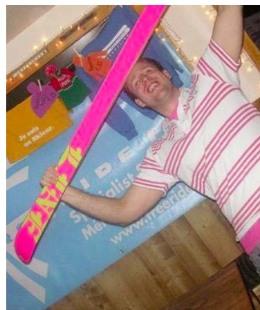
Native Show love tour. Bubble 1650. Raffle grand prize

Courchevel Weather Forecast for 2000 m altitude, issued (local time): 12 am 19 Dec. Summary: A light covering of new snow mostly falling on Tue night. Temperatures will be below freezing (max -1°C on Tue morning, min -12°C on Wed night). Winds decreasing (fresh winds from the S on Mon afternoon, light winds from the SSW by Wed night). Courtesy of www.snow-forecast.com