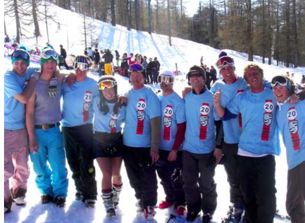
Last years Boss des Bosses team

course in Chamonix and after looking down I have said "Do you know what? If I didn't really need to go down this run I wouldn't". And not only do they have to ski it but they have to ski it at speed. Whether they do a perfect run or they wipe out they have at least stepped up, manned up, grew a pair, call it what you will. So all we need now is for people ( YOU ) to come and support them. Now compared to other resorts Courchevel has always had a trouble finding people to support. While other resorts regularly bring two coach loads of supporters we have trouble even filling one. Which is a shame as the whole day out, both on the mountain and later in Chamonix town is one of best I've ever experienced. Last year was one of the best, both weather and competition wise. Judging from the number of people from Courchevel who went to the X-Games last Wednesday there are definitely people up for a good fun day out. Big thanks to Snowlinx, le Kalico, Magic in Motion, Momentum snowsports, Ski Higher and La Boulotte the tickets for the coach have been subsidised down to only 15 euros. If you just want to come and watch the race the price for a pedestrian lift pass is only 12 euros. Alternately if you want to bring skis and ski around the Grand Montet ski area, where the race is being held, as well then a days pass is only 22 euros.