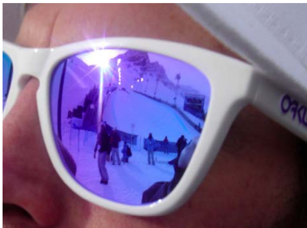
Superpipe in Tignes lived up to its name