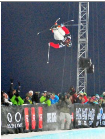
Kevin Rolland wins gold at the Ski Superpipe at the Winter X-Games

To pre book now call: 04 79 08 05 44 or text: 06 86 46 54 65 with date name and number of people.