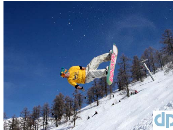
Ryan (Snowlinx) pulls one of three backflips throughout the day