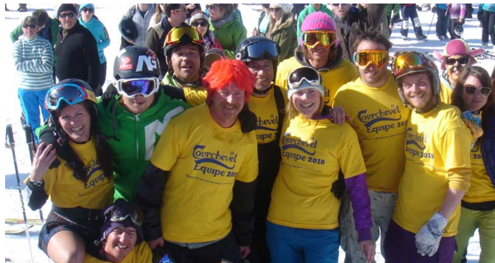
2010 Boss des Bosses team