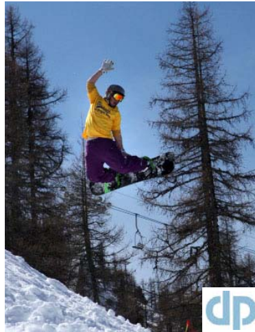
Oscar (Powder white) pulls a nice method

To pre book now call: 04 79 08 05 44 or text: 06 86 46 54 65 with date name and number of people.