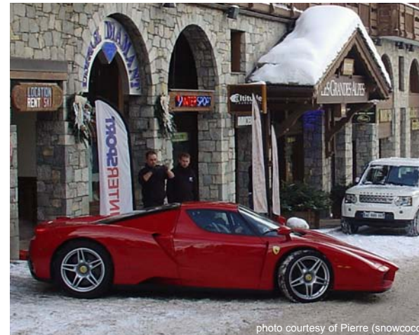
A Ferrari Enzo - stops traffic litterly!

Regardless of the state of the economy in the rest of the world you can guarantee someone around Courchevel will be flaunting their conspicuous consumption. If not in the size of their chalet then it's what they are driving. Now Ferraris are no big thing in Courchevel with 430s a dime a dozen in the spring. But earlier this week 3 Ferraris arrived on the back of a flat bed truck (because of the snow) at the hotel Grand Alpes. An Enzo (1 million + euro), a 430 (approx 200k) and my personal favourite a classic F40(400k+). Today they left resort, but as they couldn't go up the hill around the 1 way system (because of the snow), they had traffic stopped down to the roundabout. And the drivers? Russian? Monegasque? No. on closer inspection all the cars had English registrations.