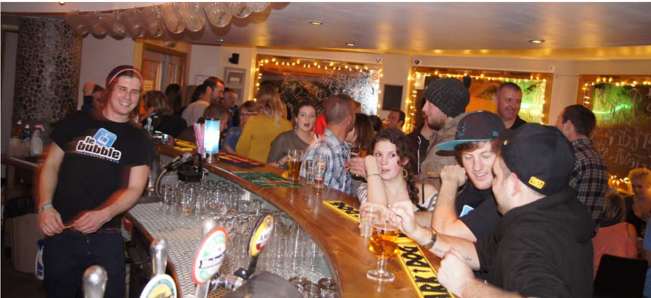
It's all about Byron at the opening of the bubble bar