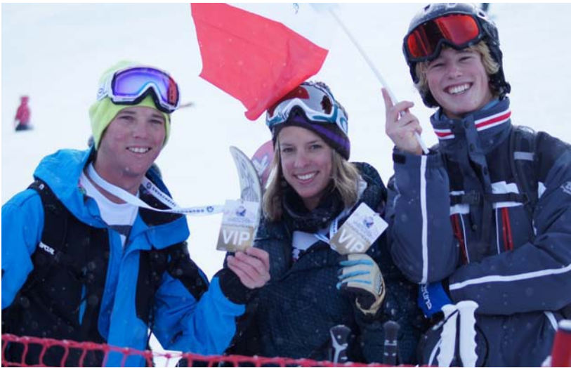
Proof that anyone can get a VIP pass for the Womens slalom (except to Tom(MW) right)