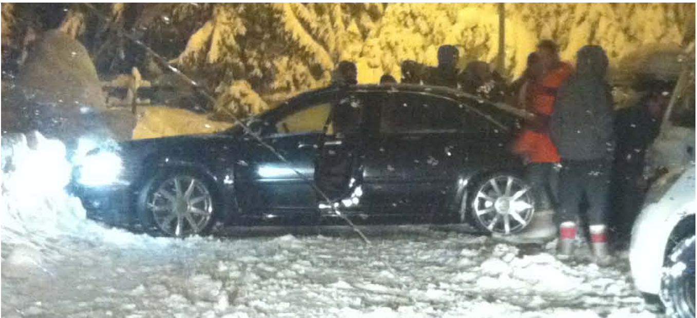
Vorsprung durrrrrr Parking - as they say at Audi secret test track